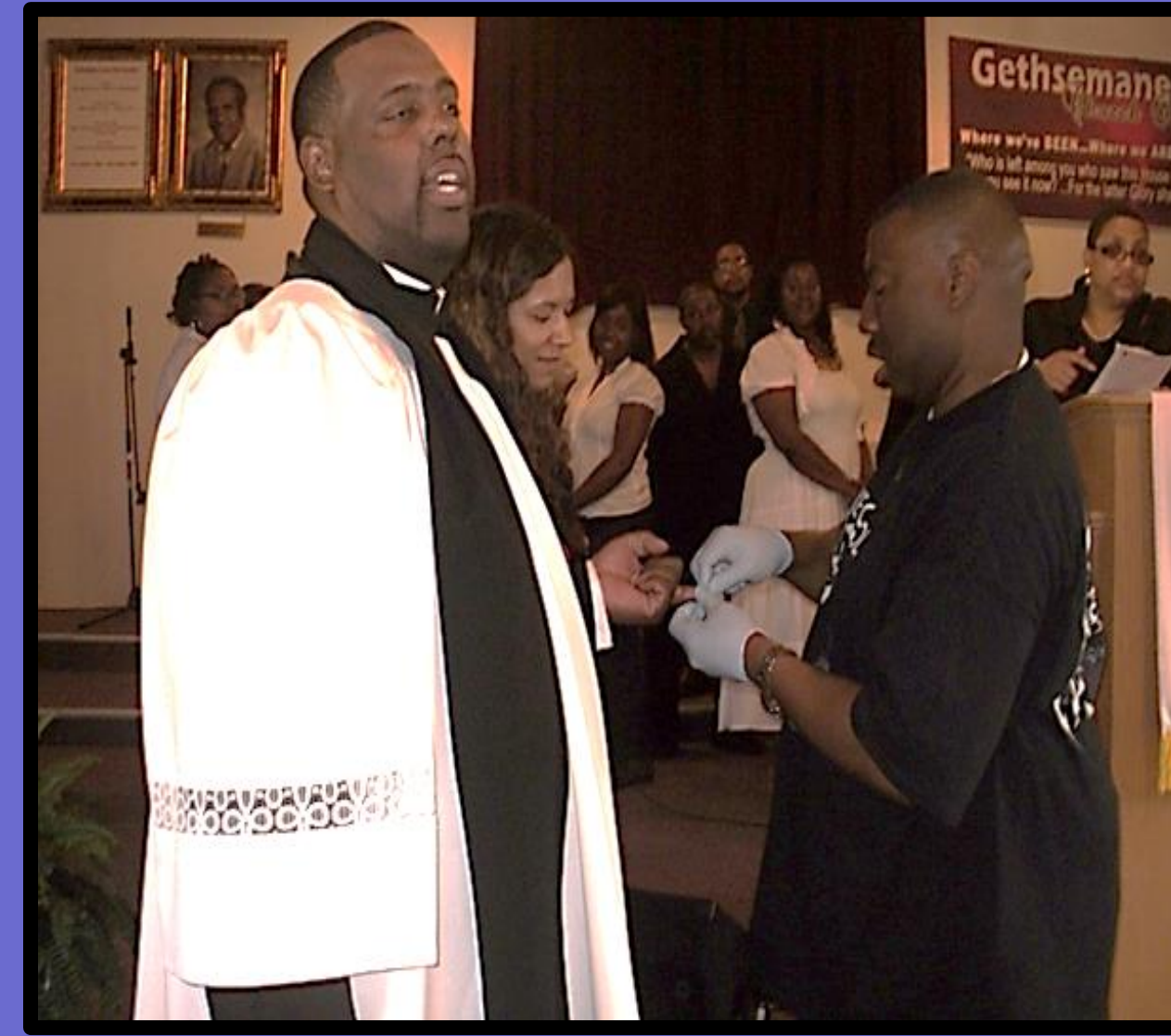
HIV/STI Testing Motivational Strategies: Role Modeling and HIV Testing Process Explanation