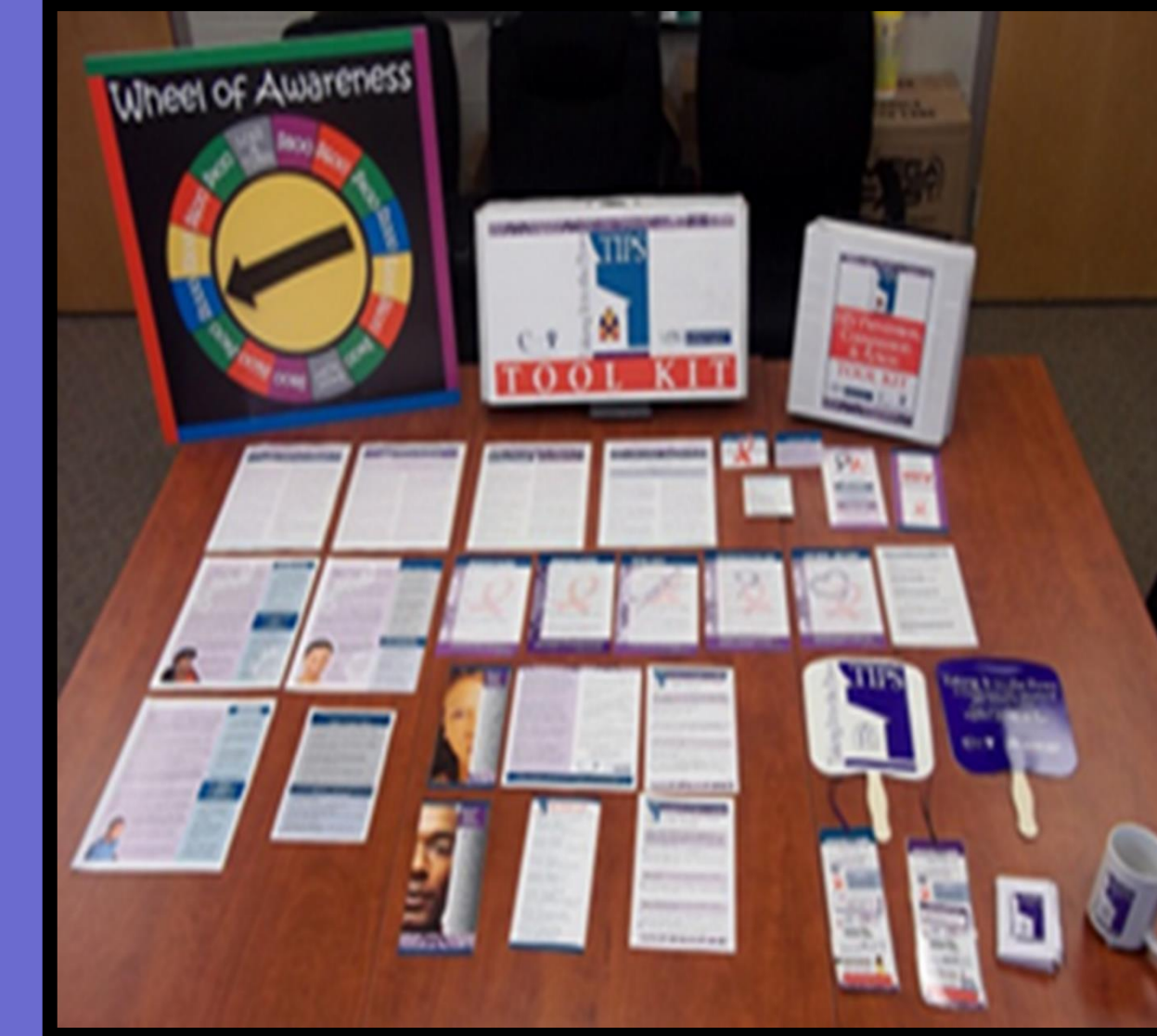
TIPS Culturally and Religiously-tailored Materials and Activities